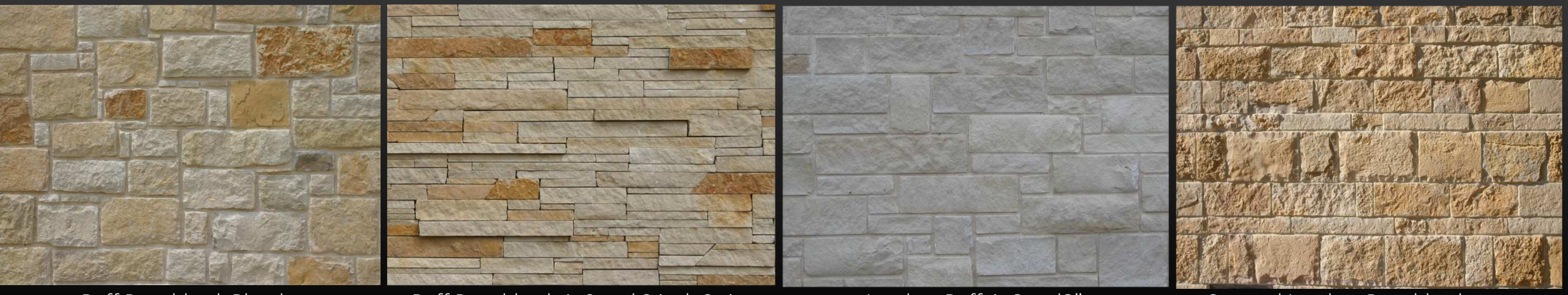
Buff Roughback Blend